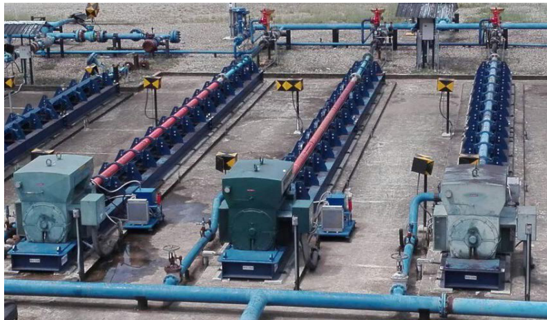
Novomet components used to replace only the failed components in a competitor HPS installation.